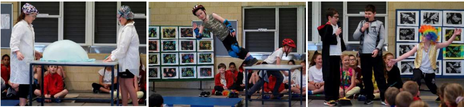
Some of the Talent Show Contestants from Room 10.

For more photos from the assembly click here