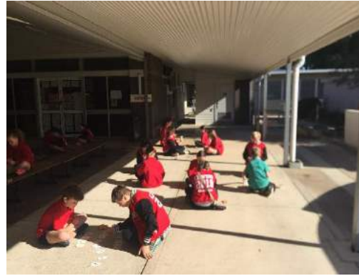
Year 6 and Year 4 students playing Numero against one another.