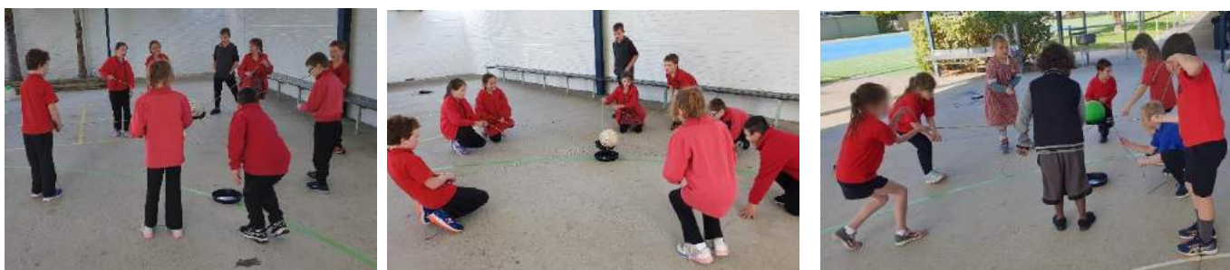
Students participating in Monday's Science Week lunchtime activity