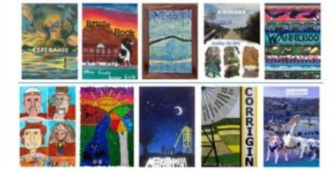
Images: #ShireEsprit in Photo 2019 and 2021 State Winners for each category

If you have any questions please contact our Community Development Officer on 9071 0678 or email info@esperance.wa.gov.au