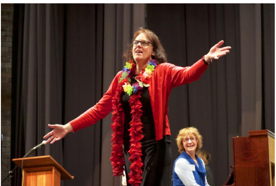
<u>Click here</u> to view a gallery of photos from the 2018 Esperance Music Festival.