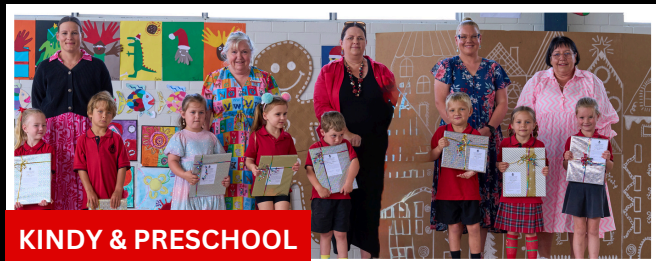
KINDY & PRESCHOOL