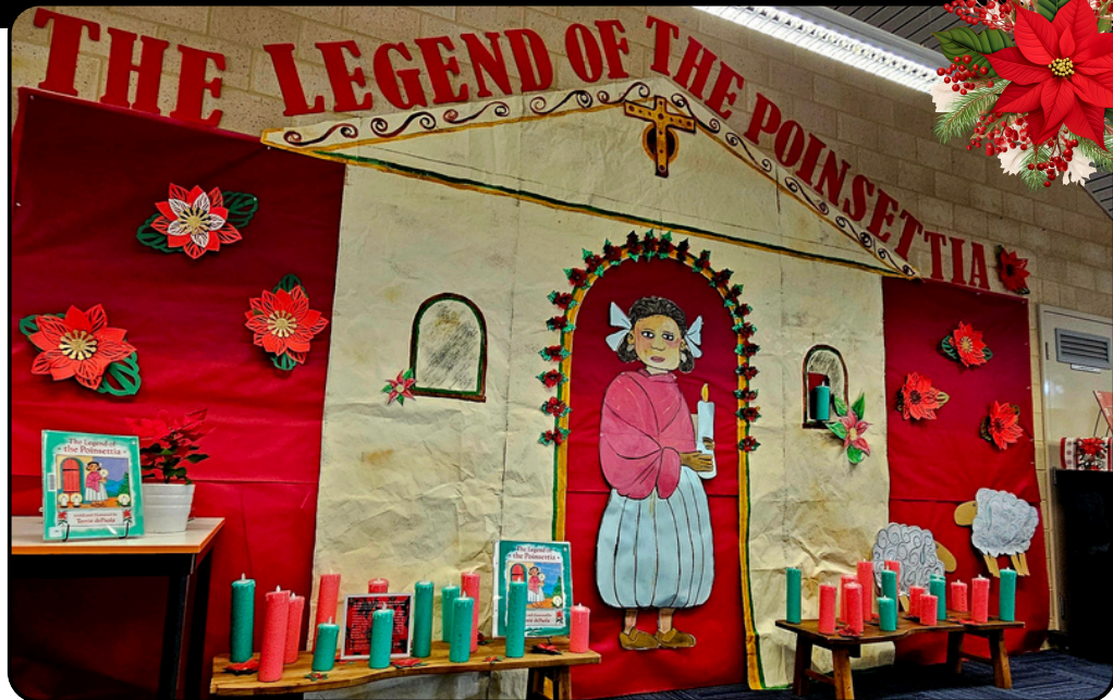
This year's library Christmas display featured The Legend of the Poinsettia, a beautiful story set in Mexico that celebrates kindness and tradition. It brought festive cheer and a splash of vibrant colour to our space and Bunnings sold a few more poinsettias!