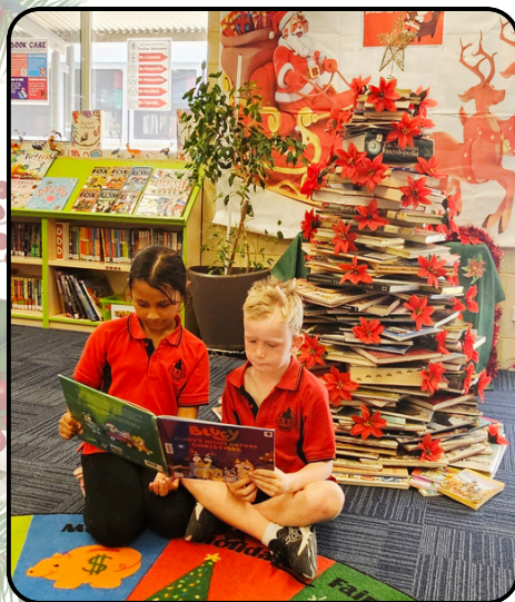
Poinsettia bookmas tree before the elf made mischief!