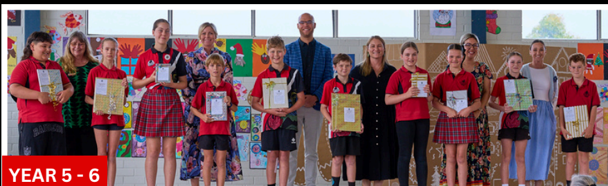
YEAR 5 - 6

Congratulations! TO ALL THE BOOK WINNERS