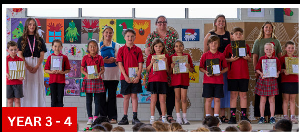
YEAR 3 - 4