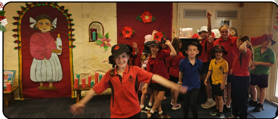
"We found the elf!" He was hiding in the piano composing his next festive tune!