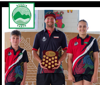
FACTION SPORTS SHIELD