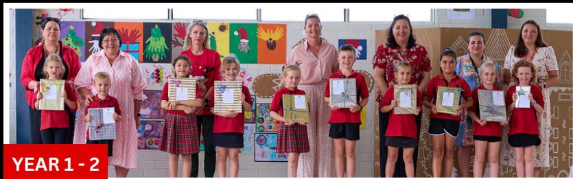
YEAR 1 - 2