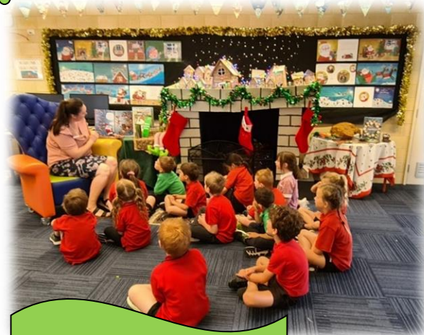
Rm 2 enjoying a Christmas story in the library.