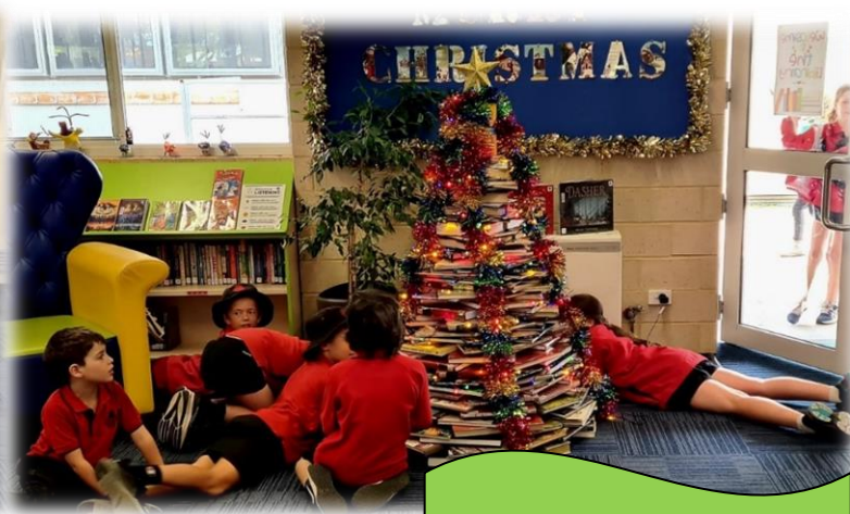
"Warm, hot, BOILING" – looking for the pesky library elf!!