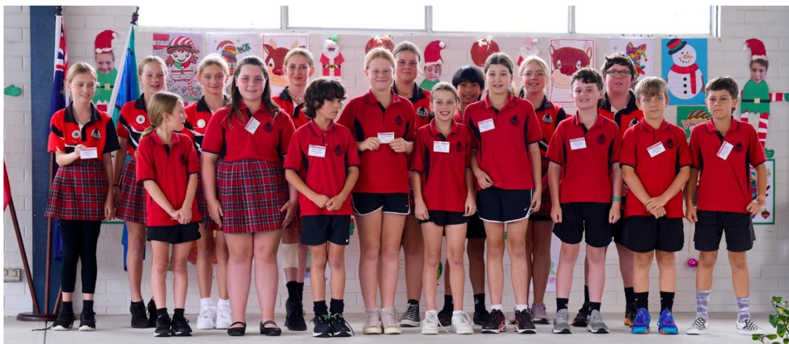
Our incoming and outgoing Student Leaders